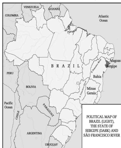
Map 1: Brazil and the state of Sergipe